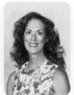
CHRISTY MOORE Brance